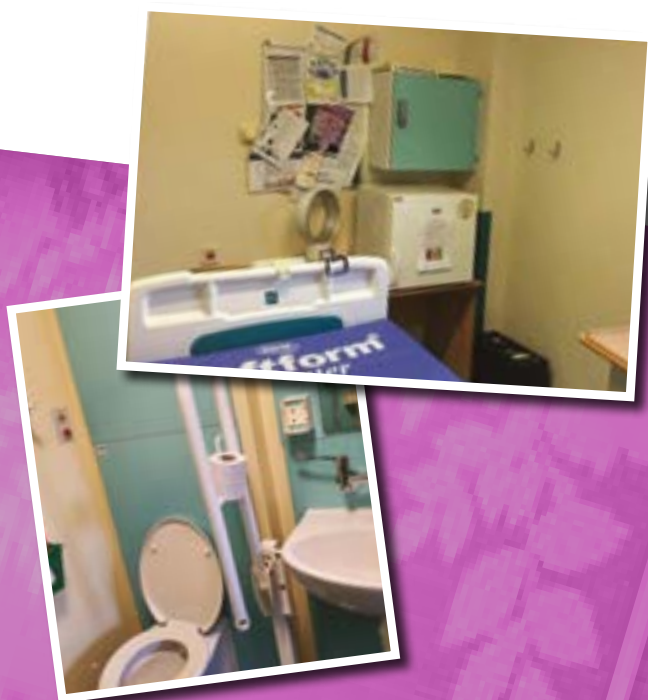
Current NHS Patient Room